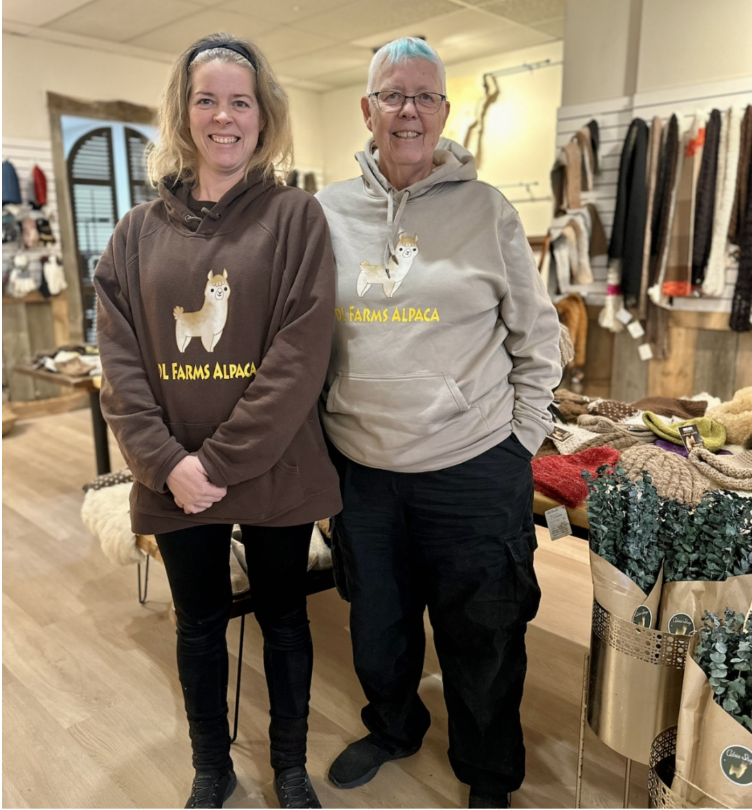
Adria Shop - Alpaca Fibre Products & Antiques