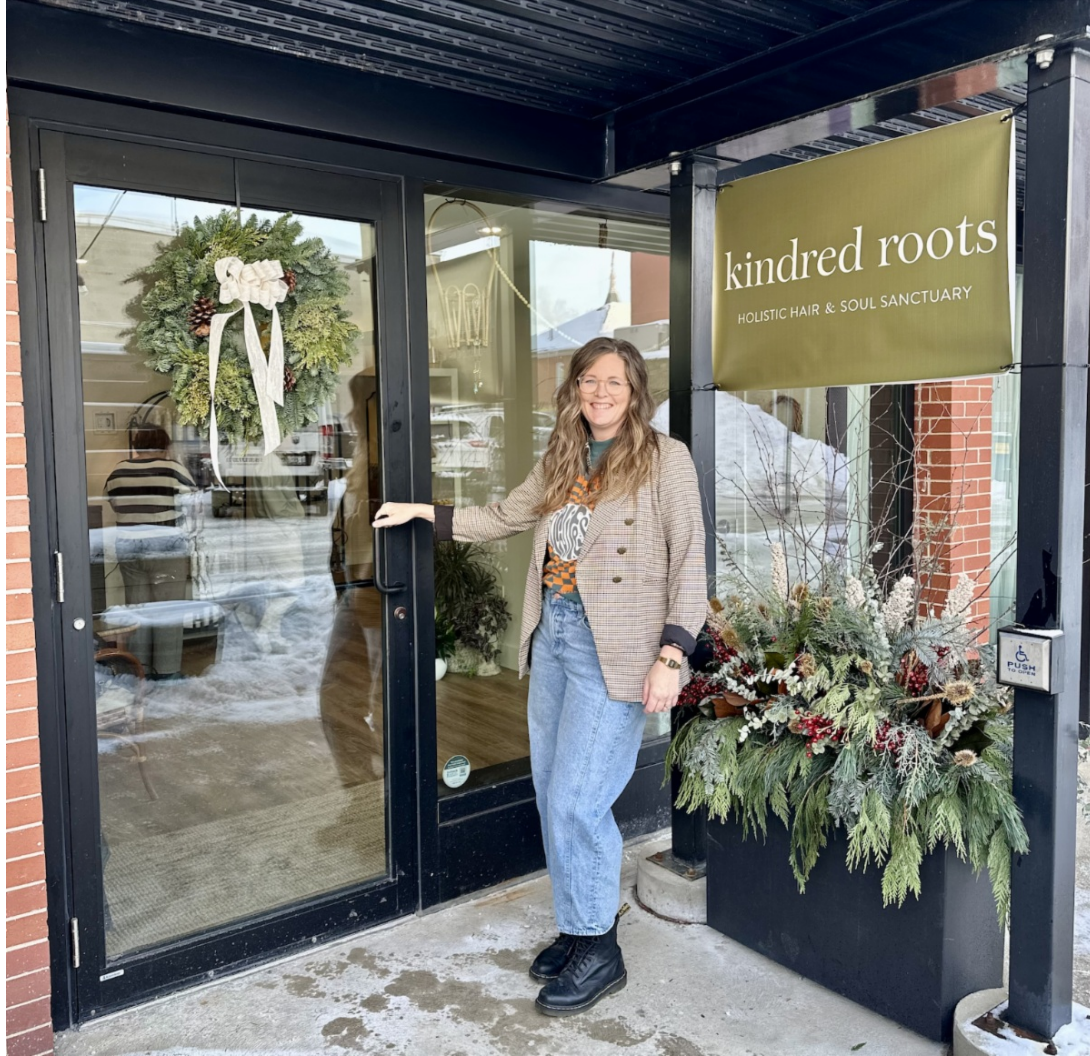
Kindred Roots Hair