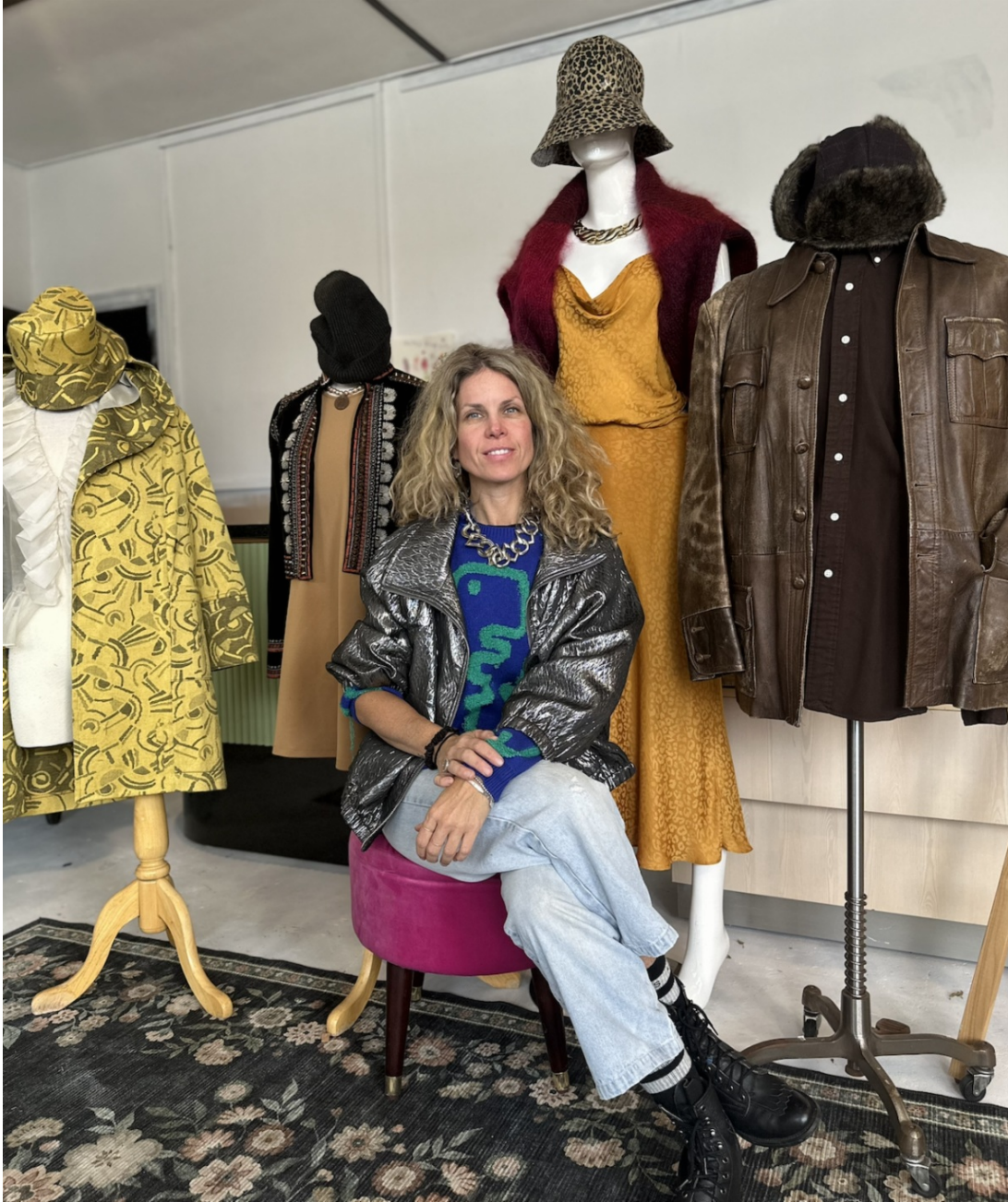
Formerly The Glass Shoppe