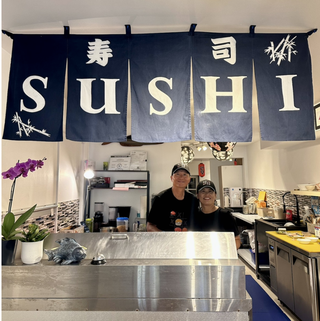
Mr Kim's Sushi - New Location