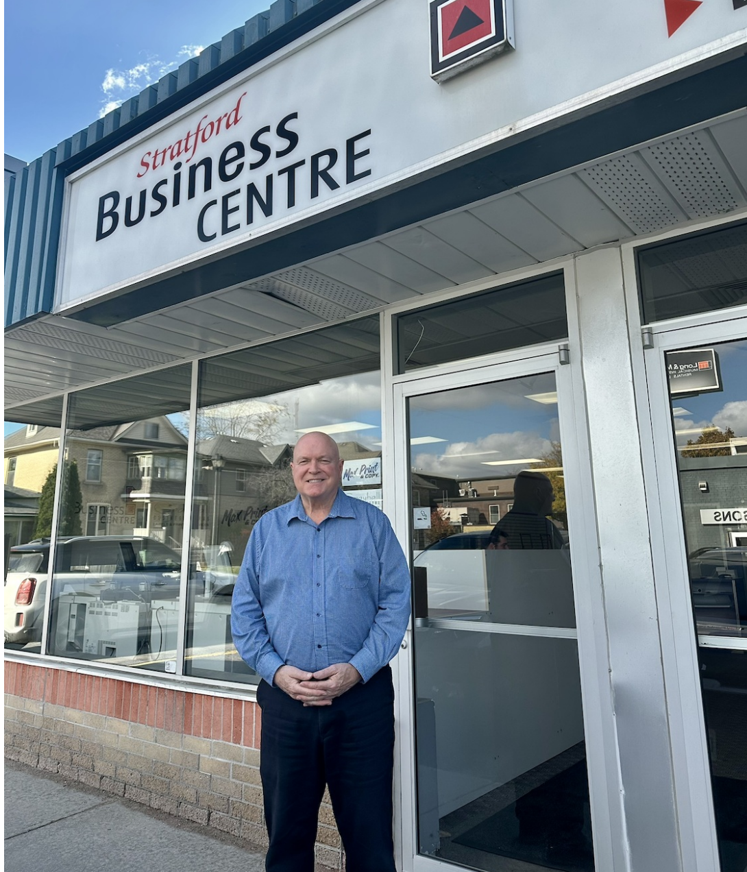
Stratford Business Centre - New Owners