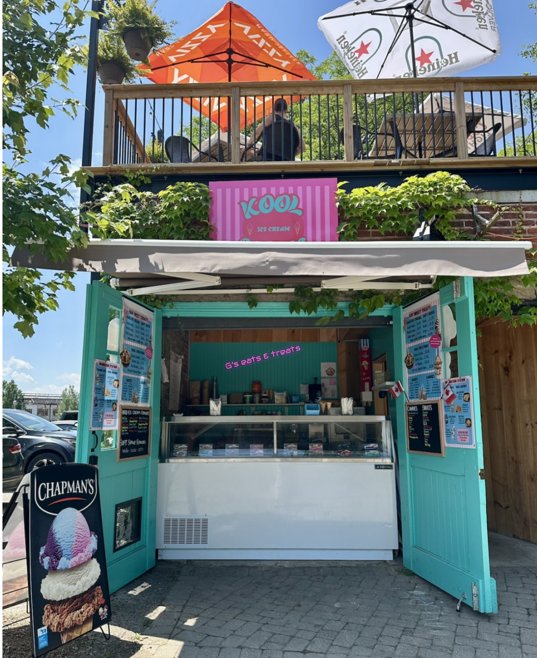
Kool Scoops Ice Cream