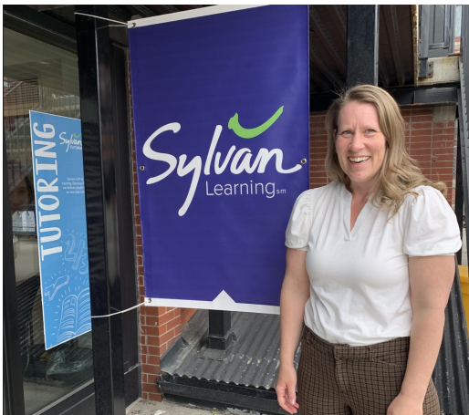
Sylvan Learning Centre