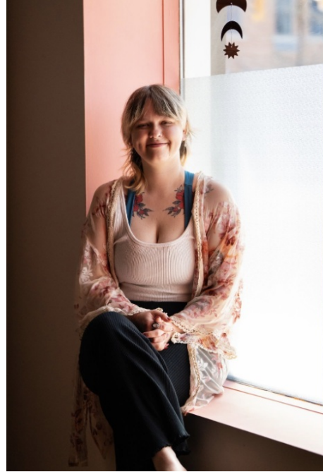
The Third Space