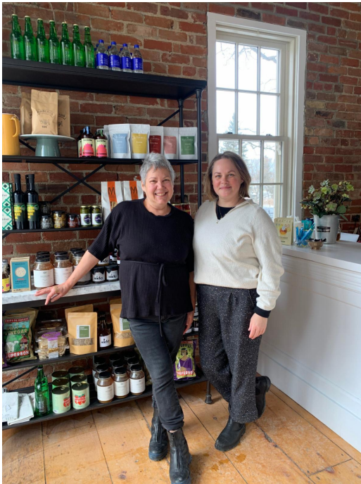
Flour Mill Outpost

Click the buttons below to read our New Business stories in the Business Spotlight section of our website.