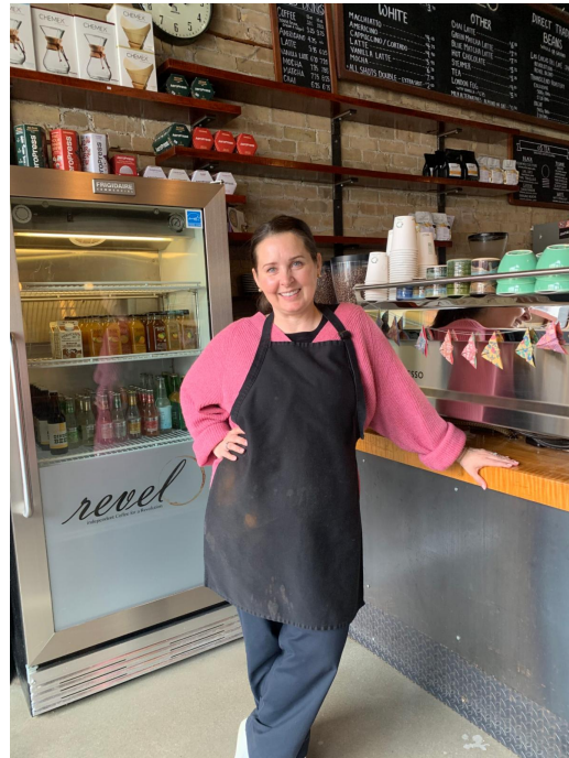
New Revel Owners