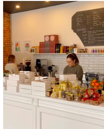
Flour Mill Outpost Coming Next Month!