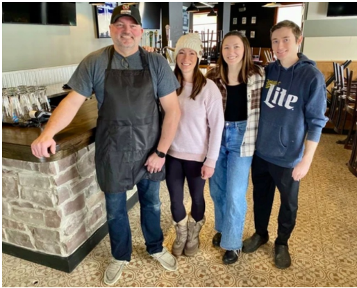
WORK Pub & Eatery