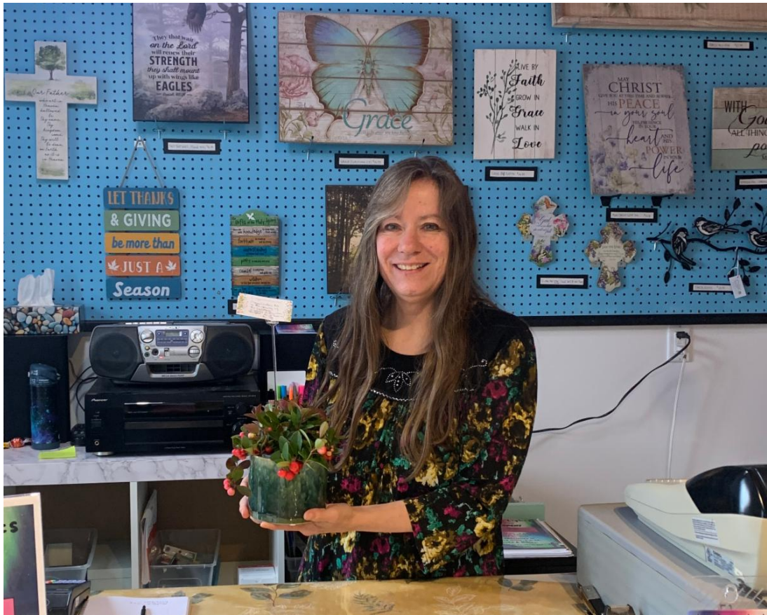
Northern Lights Gift Shop